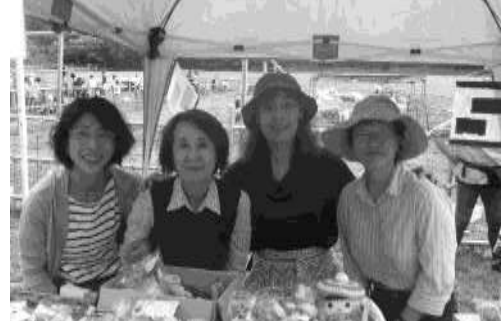
'Greens Fair' in May (Welfare Village)

Our hearts are too full for the things close at hand to tell our hopes. All we can say is we'll go on and on bearing our colors and aroma.