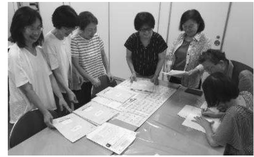
Sending out a newsletter ' Hanamizuki ' (Osaka Church)

We'll continue to pray for people in difficulties as we've been doing so in the past. Right now, we're praying for the people victimized in the West Japan Torrential Downpour. We especially appreciate Hiroshima Church Women's Group for their sincere work.