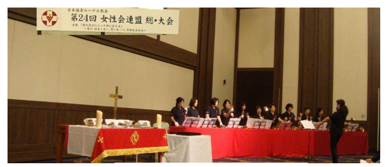
Opening service with a prelude of hand bells

Scriptural Theme: Now if we be dead with Christ, we believe that we shall also live with him"—Romans Chapter 6: 8