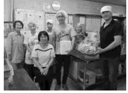
Visiting 'Rainbow House' in July (Saga Church)

We pray for independent members who hope to remain in faith. We also pray for the members who have difficulties going to church. It is our great wish not to let anyone feel solitude through mutual prayers. We hope to broaden a circle of prayer lit up with the light of 50 years' history together with strong and mentally flexible women.