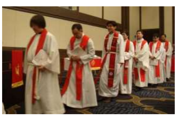
Entrance of pastors/clergymen